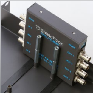
Stackable standoff extension pieces