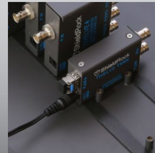
Flexible power cabling options