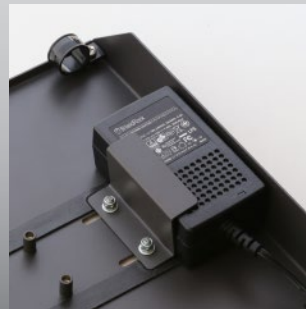
Re-sizeable power supply clamp