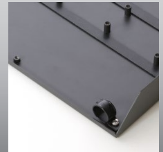
Cable retention and clamping